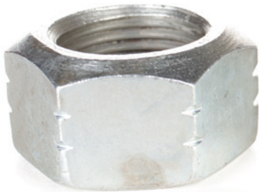
Old Part Number: 1140

The 1140X is a reliable off-the-shelf alternative to the 1140 custom lock nut. We've made this change to resolve a concern where the threads on the piston rod of 45020 PV and 20020 SC glycol pumps have been damaged during routine maintenance.