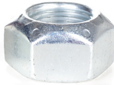
New Part Number: 1140X

Will remain in Repair Kits until 4/1/2021 Requires 1-1/4" Socket