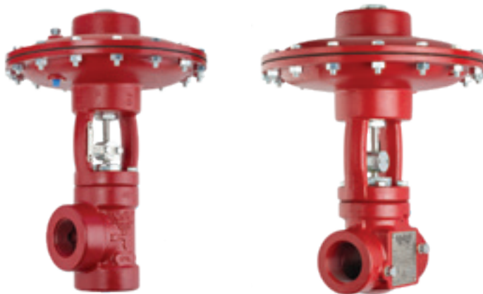
Kimray's Angled and Through Body High Pressure Control Valves