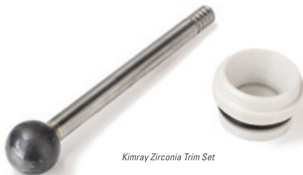
Kimray Zirconia Trim Set